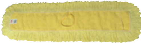
Looped-end dust mop traps more dust.