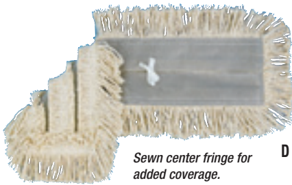
Sewn center fringe for added coverage.